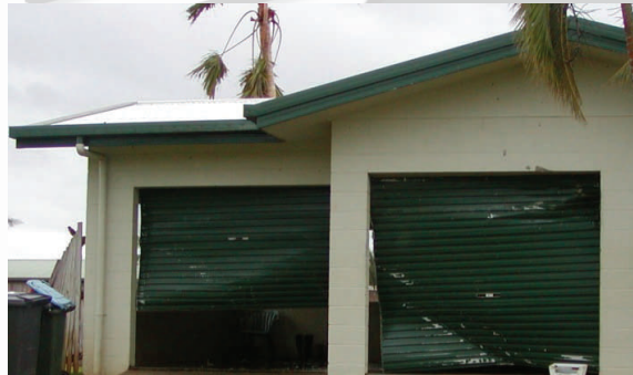
Damage to garage doors.

It is common to see garage doors fail when they are pushed in or out by strong winds.