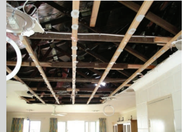
Damage to ceiling due to water ingress

Damage to eaves lining by strong winds is another common cause of damage to houses. This can happen due to inadequate fixing or support for the eaves lining or because the lining spans too far. Eaves lining damage allows rain and wind to blow into the roof space, which may result in damage to ceiling and wall lining inside your house.