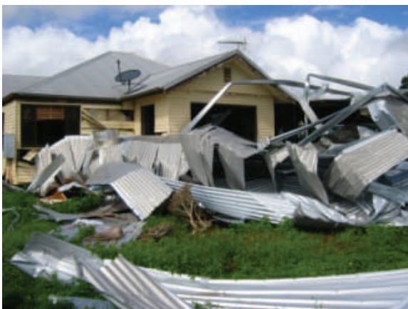
Flying debris resting in front of a house

Other outdoor objects and equipment such as air conditioning equipment, hot water tanks, swimming pool equipment, solar water panels, satellite dishes, antennas and similar objects may be blown around in a cyclone and can become flying debris that could impact your house or other houses in your neighborhood. You should ensure that all equipment is not loose and that it is properly fixed.