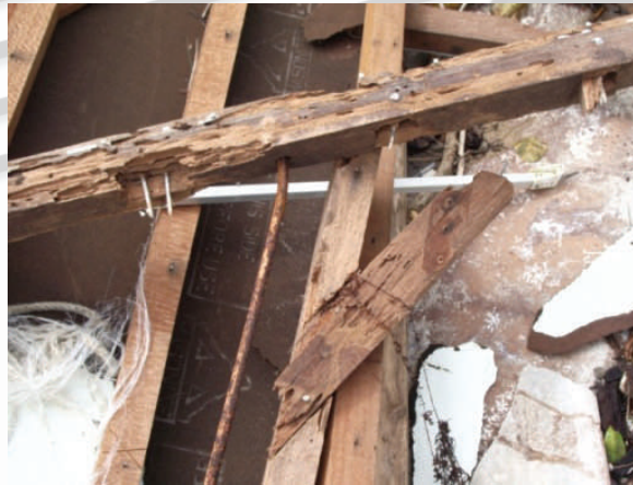
Termite attack to timber

Cyclonic regions within Australia are often areas of high termite risk and therefore, timbers in your house may be susceptible to termite attack. Timber protection systems require on-going inspection and maintenance to ensure they provide an effective on-going barrier to termite attack. If it is found that termites have attacked timbers in your house, expert advice should be sought on whether the timber needs to be replaced and to repair the termite barrier.