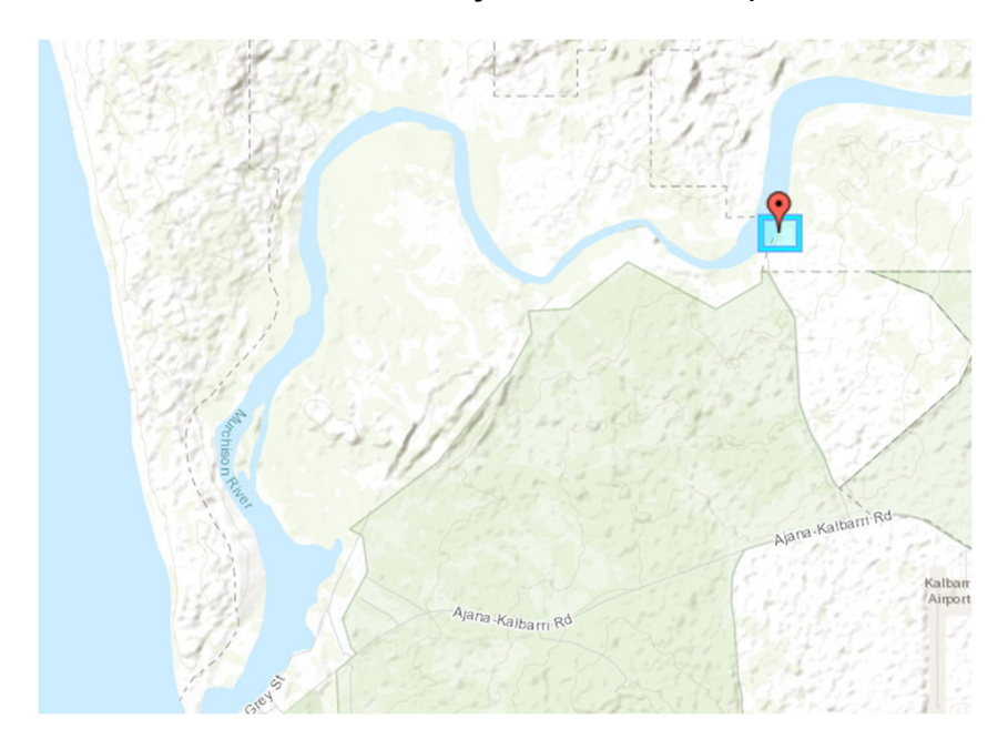
Plan 3 – 5618 Ajana-Kalbarri Rd (Murchison House Station)