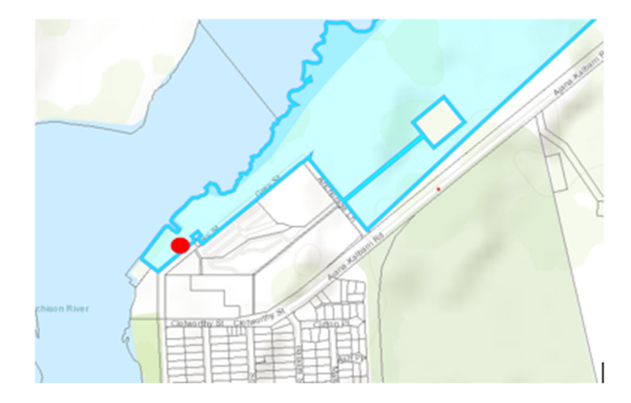
Plan 2 – Reserve 26591 Grey Street (Gidamarra Spring)