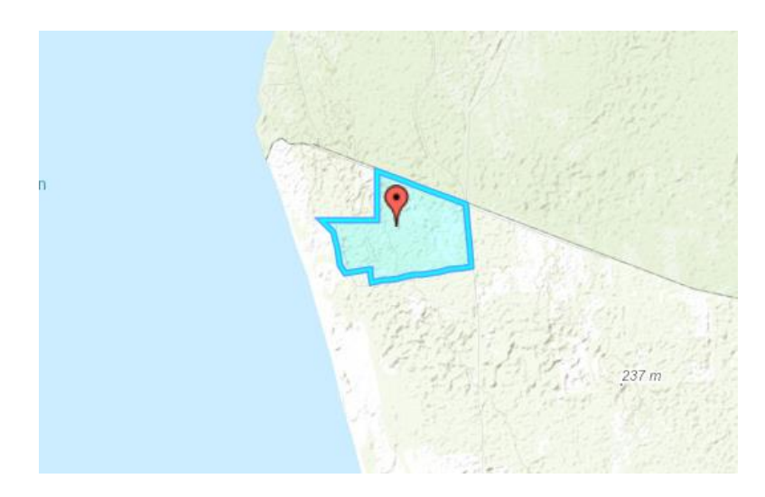
Lot 11 (No. 4043) George Grey Drive, Yallabatharra.

The Application for Development Approval has been referred to Council as the Commercial Recreational Tourism use is proposed on Crown Land located within the Shire of Northampton with the existing agreement due to expire 14 June 2024.