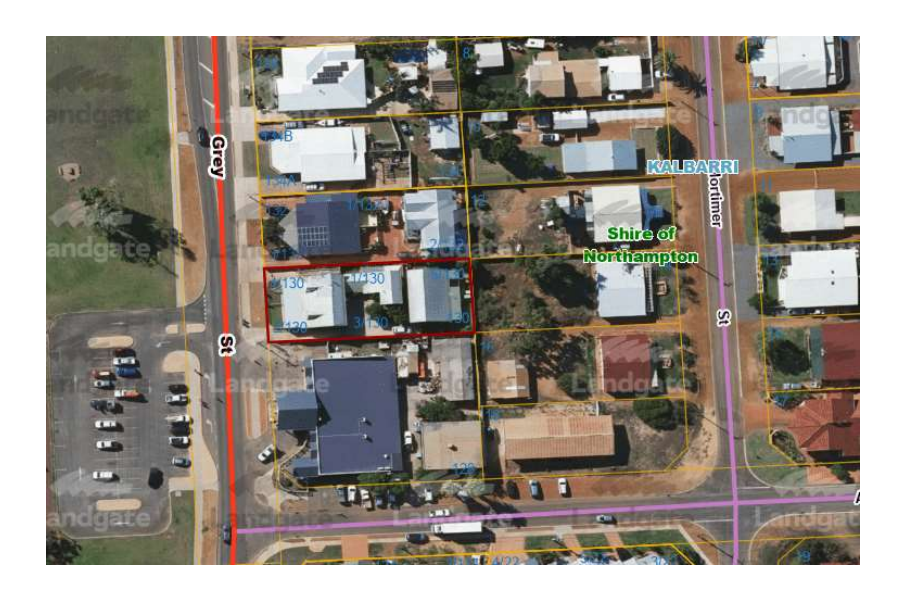
Minutes - Ordinary Meeting of Council - 15 February 2024