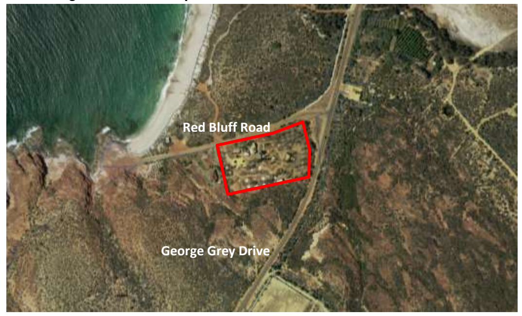
Figure 1 - Location plan for Lot 10646 Red Bluff Road, Kalbarri