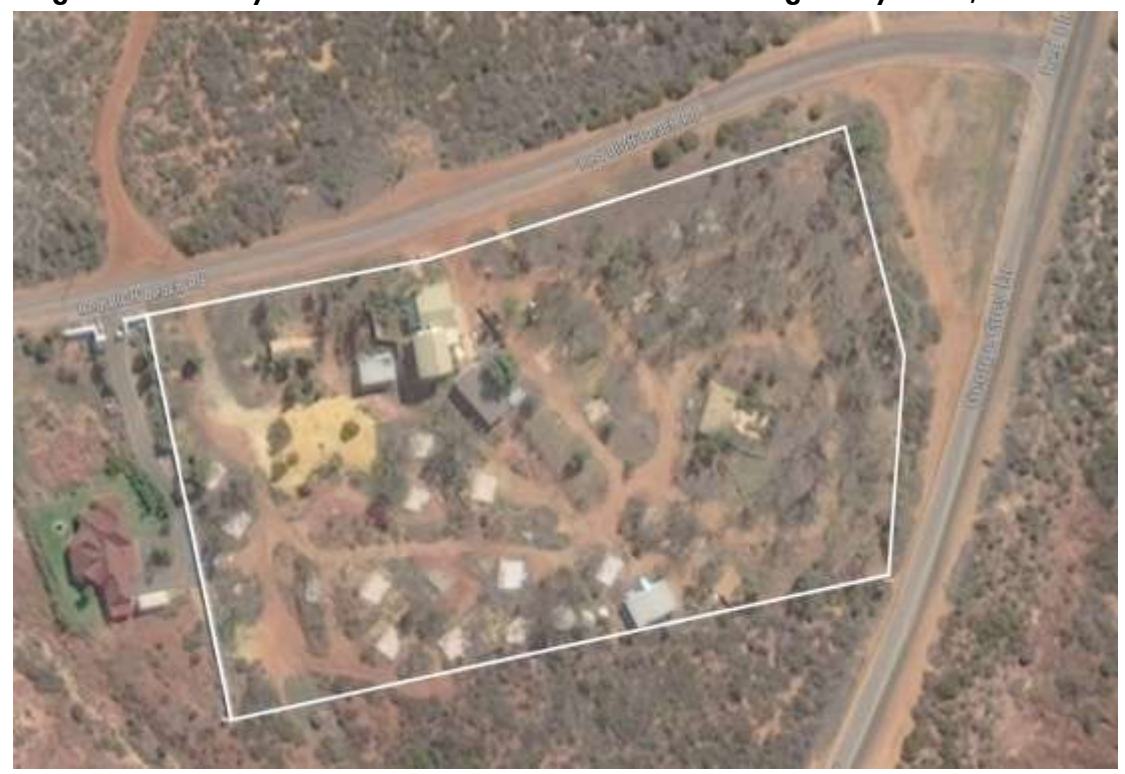
Figure 1 - Locality Plan Lot 10646 Red Bluff Road & George Grey Drive, Kalbarri

establishment of a caravan park, chalets, restaurant, shop, office and caretakers upon the site which is also being presented to Council at its 18 November 2016 meeting.