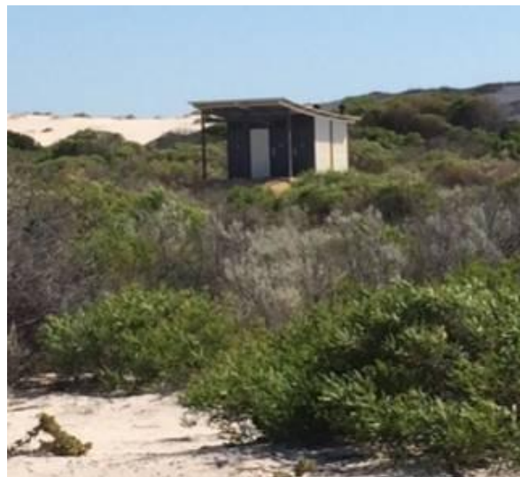
Lucky Bay facilities