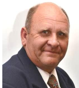
Deputy President, Kalbarri Ward