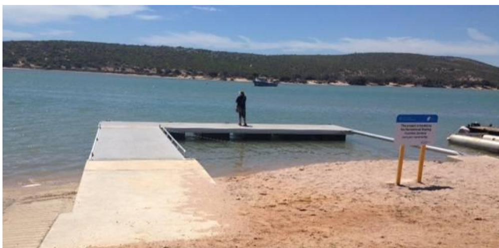
Floating finger jetty – Kalbarri Northern Boat Ramp