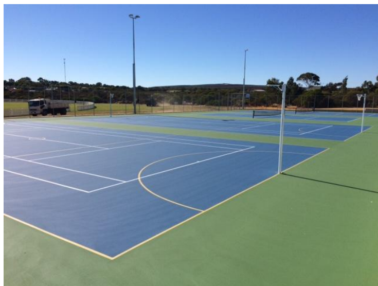
Kalbarri tennis, netball & basketball courts

To everybody in our shire, thank you for your support as we all go forward into another year