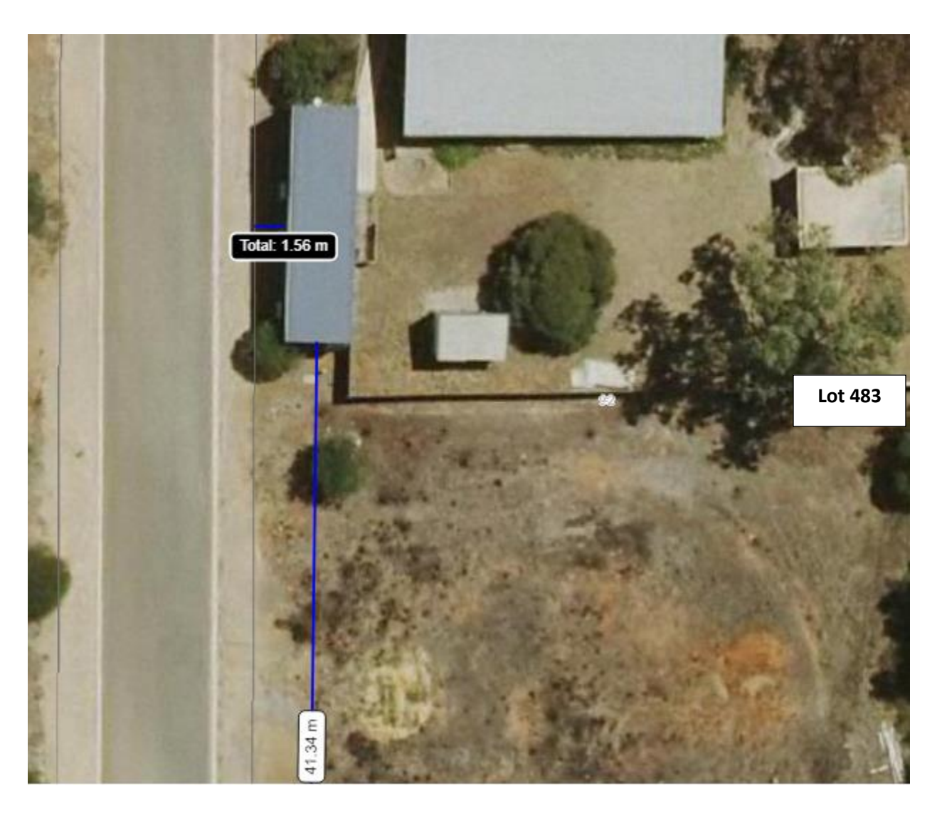
APPENDIX 2 - Photos