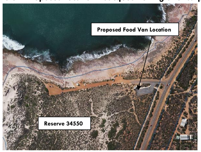
Figure 3 - Proposed location - Jacques Point gravel carpark